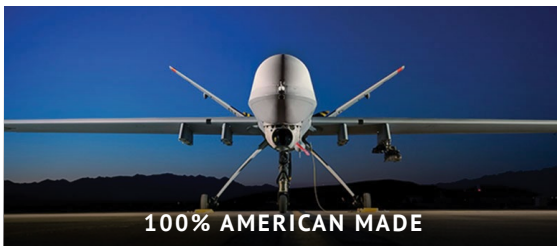
100% AMERICAN MADE

Calumet is one of very few PCB manufacturers with the new IPC 1791 Trust accreditation. Our certification qualifies us to handle the most sensitive ITAR, export controlled or Controlled Unclassified Information (CUI).