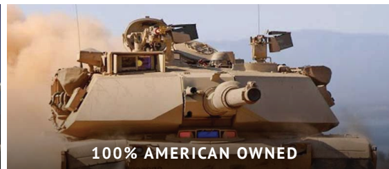
100% AMERICAN OWNED